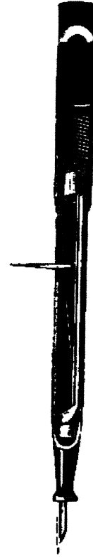
Sectional View No. 2